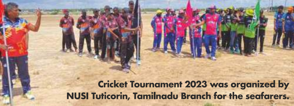
Cricket Tournament 2023 was organized by NUSI Tuticorin, Tamilnadu Branch for the seafarers.