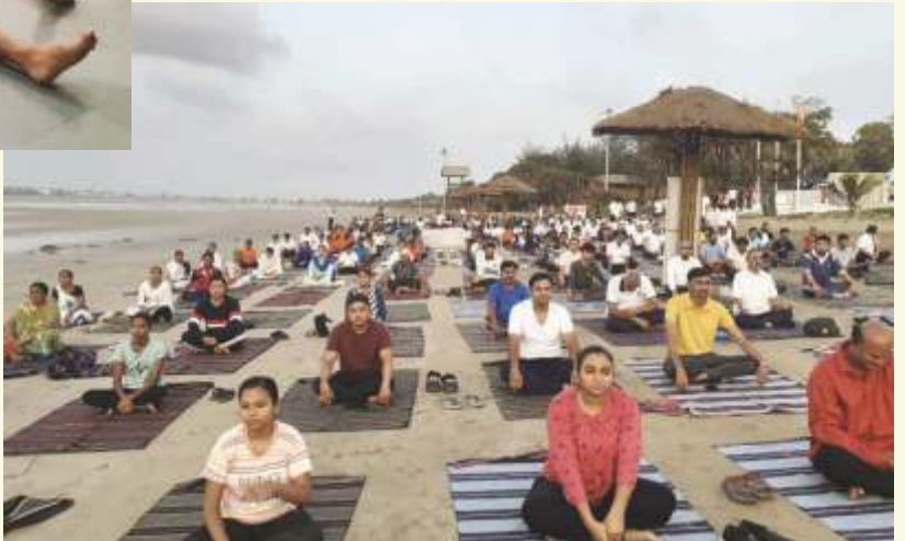
▶ International Yoga Day along with NUSI Diu Youth Committee members, seafarers and their families at Ghoghla beach