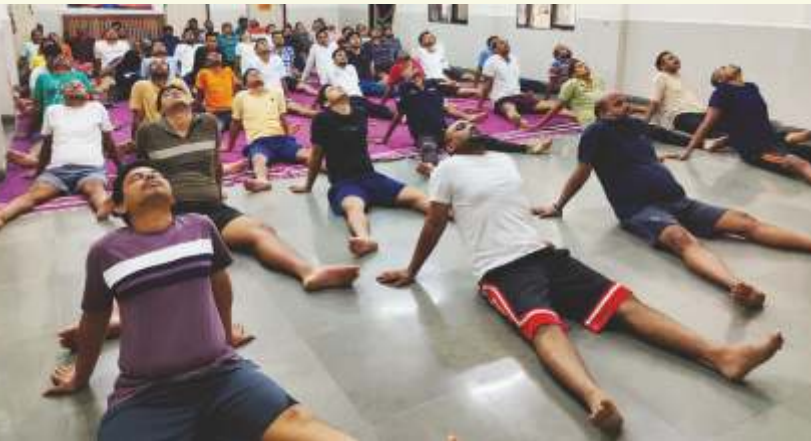
◀ International Yoga Day at Indian Sailors Home Society (ISHS)