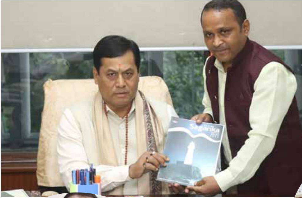
Honourable Shri. Sarbananda Sonowal, Cabinet Minister of Ports, Shipping and Waterways and Cabinet Minister of AYUSH