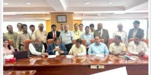
आज की अजयजी न्याय वेतन, एमएसी (एन) के 17 वें बैठक में नुसिने जहाज पर जाने वाले नाविकों के वेतन में बढ़ोतरी की