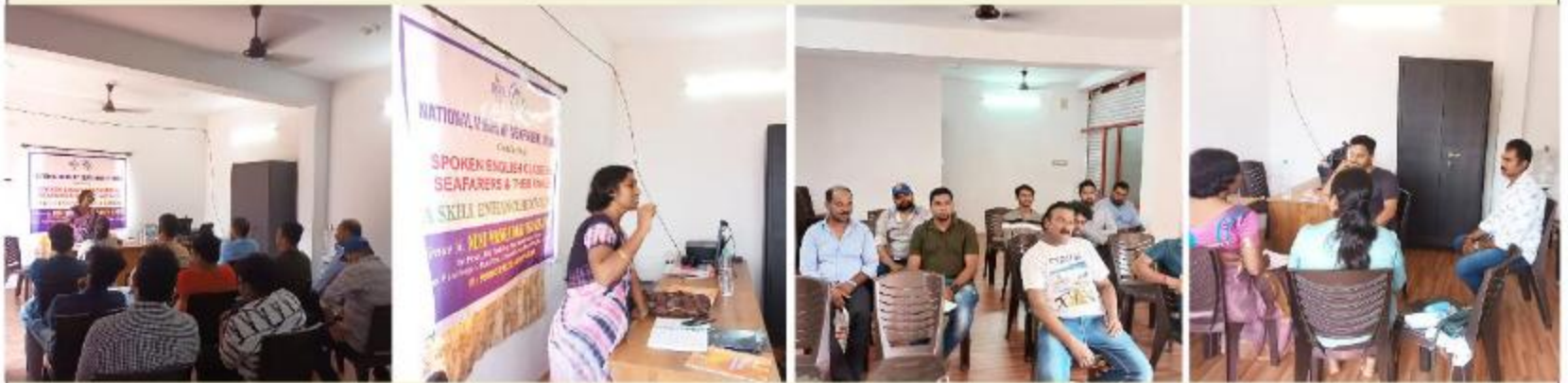
NUSI Mangalore Branch started English Spoken Classes for Seafarers and their families from October, 2023