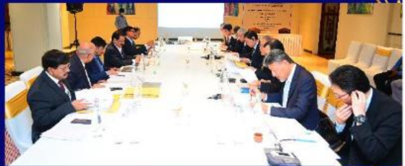
JSU IMMAJ AGREEMENT