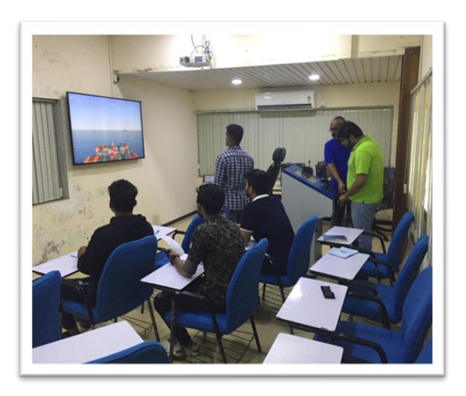
NUSI's Academic Partners ISF Group (ISF) for NOTI Panvel & MESC Valsad.

The courses are 5 day Fully Residential Courses for Deck and Engine Room Ratings with nearly 28 hours of contact time.