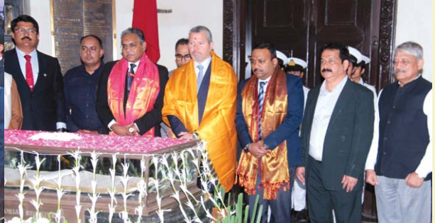
IMO Secretary-General Pays Homage to Seafarers' Sacrifice during Landmark Mumbai Visit